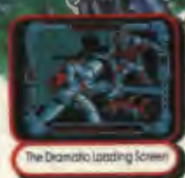
The dramatic lighting scene