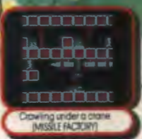
Crawling under a crane MISSILE FACTORY