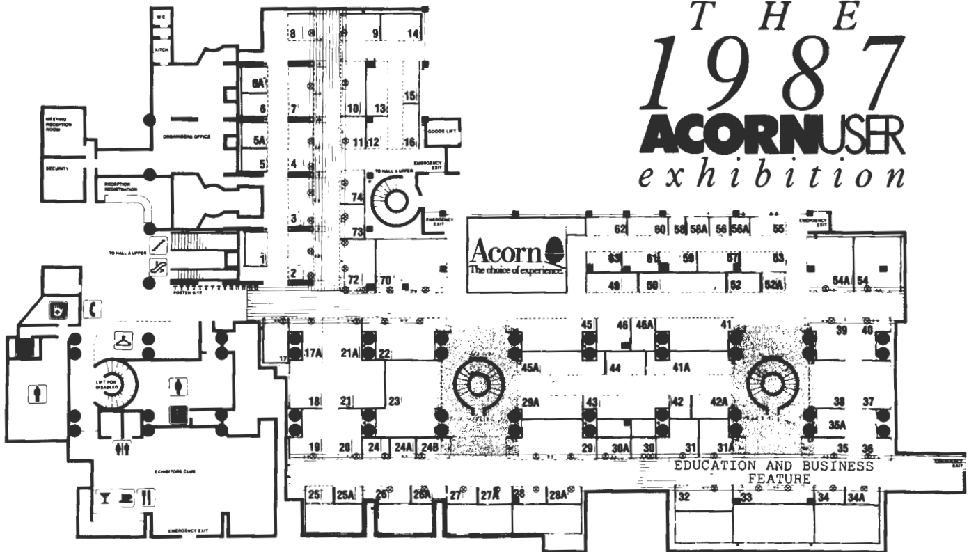
SEMINAR ROOM & CATERING AREA ON FIRST FLOOR