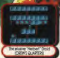
The exclusive "herbet" Droid CREW'S QUARTERS