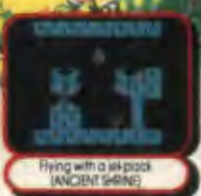
Flying with a jet-pack ANCIENT SHRINE