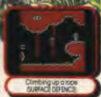
Climbing up a rope SURFACE DEFENCE